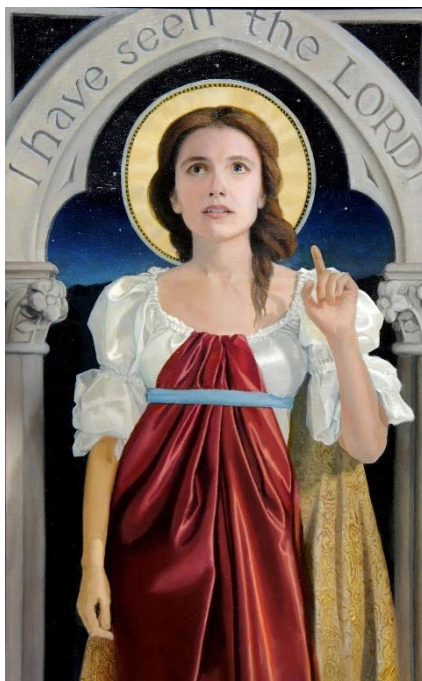
ST. MARY MAGDALENE