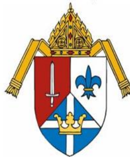
UDIOCESE OF LEXINGTON