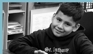
St. Anthony Taylor Mill