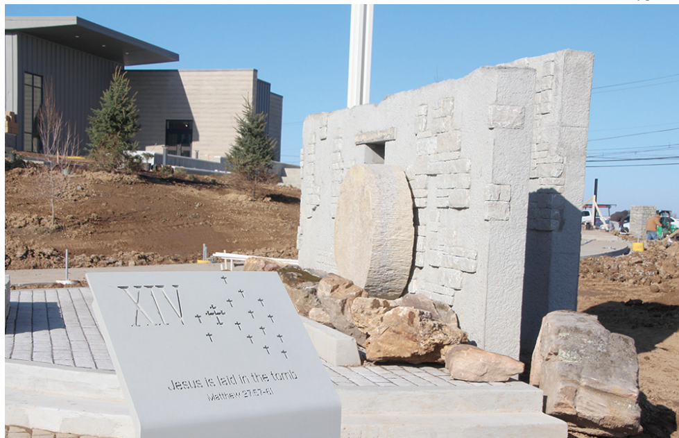
(above) The fourteenth station, when Jesus is laid in his tomb, is depicted in great detail, including a life-sized replication of Jesus' tomb, equipped with a 5,000-pound front stone.