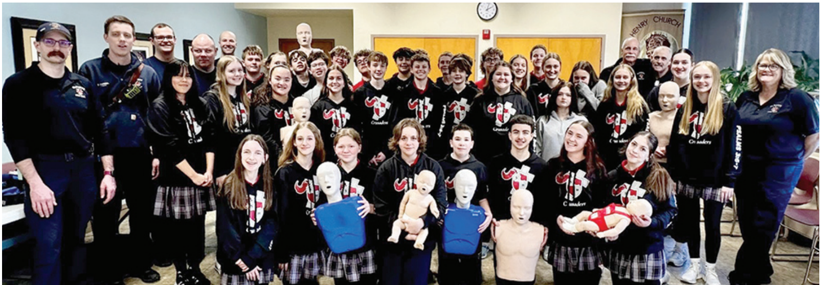
Supported by the Elsmere Fire Department, one long-standing tradition at St. Henry Catholic School, Elsmere, is learning CPR as eighth graders. Pictured is this year’s class with the training dummies used during the class.