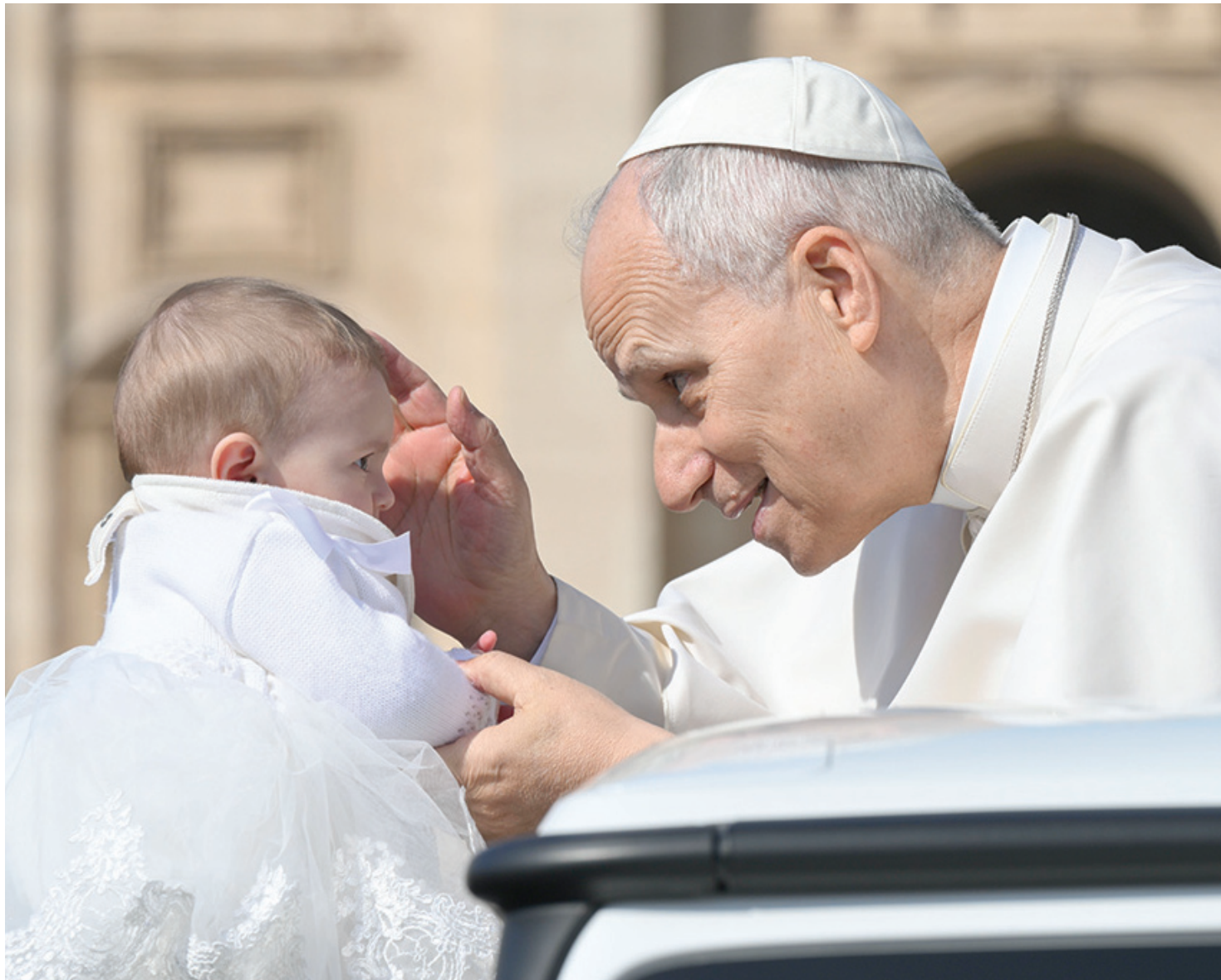
Pope Leo XIV blesses a baby during his general audience in St. Peter’s Square at the Vatican March 25, 2026.

This apostolic mission is “collegial and communal,” reflecting the Lord’s desire for “shepherds of His people” who serve with love, he said. That is why St. Paul VI presented the hierarchy as being “born of the charity of Christ, to fulfil, spread and ensure the intact and fruitful