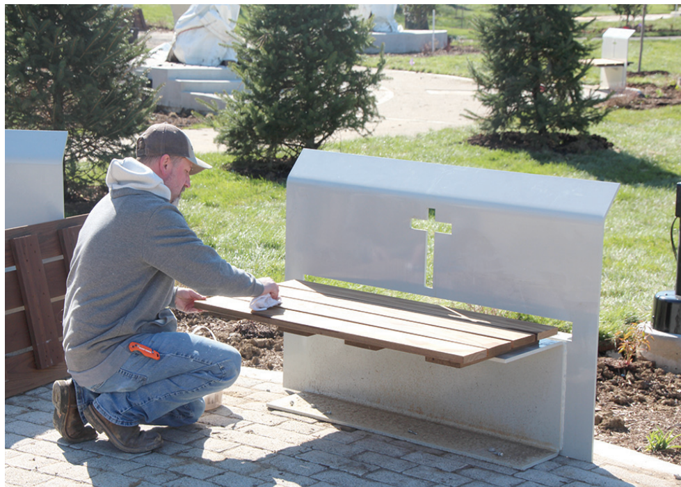
(above) A member of the construction team takes care to stain the wood seating on the benches before opening day, April 1. Ensuring that all visitors have a place to rest and reflect.