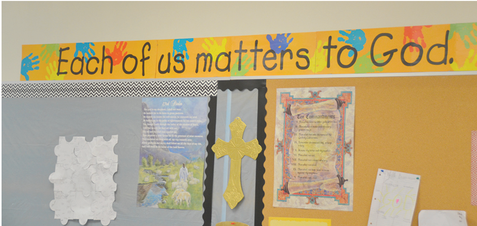
A classroom in St. Dominic Academy in the Diocese of Portland, Maine, is seen in this undated photo.