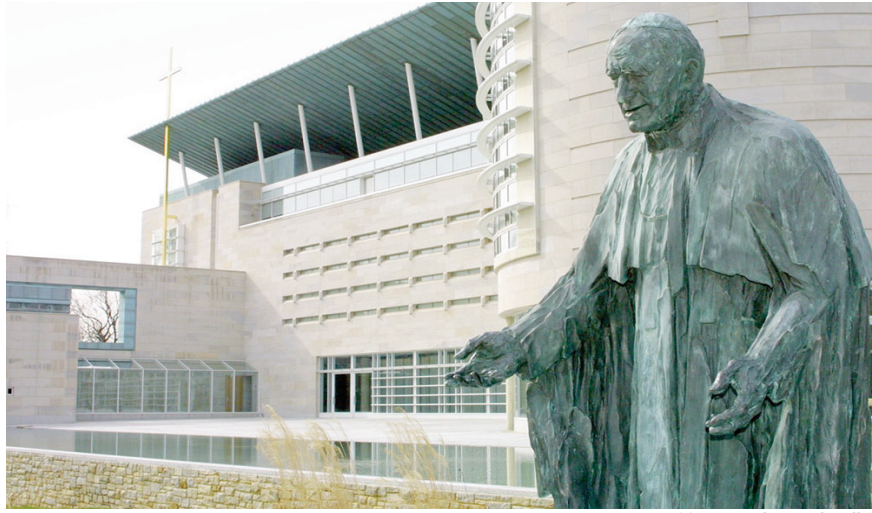
A file photo shows a statue of St. John Paul II outside the St. John Paul II National Shrine in Washington.

Its neighbors include the Archdiocese of Washington’s St. John Paul II Seminary, the Jeanne Jugan Residence operated by the Little Sisters of the Poor, Capuchin College, the Ukrainian Catholic National Shrine of the Holy Family, The Catholic University of America and the