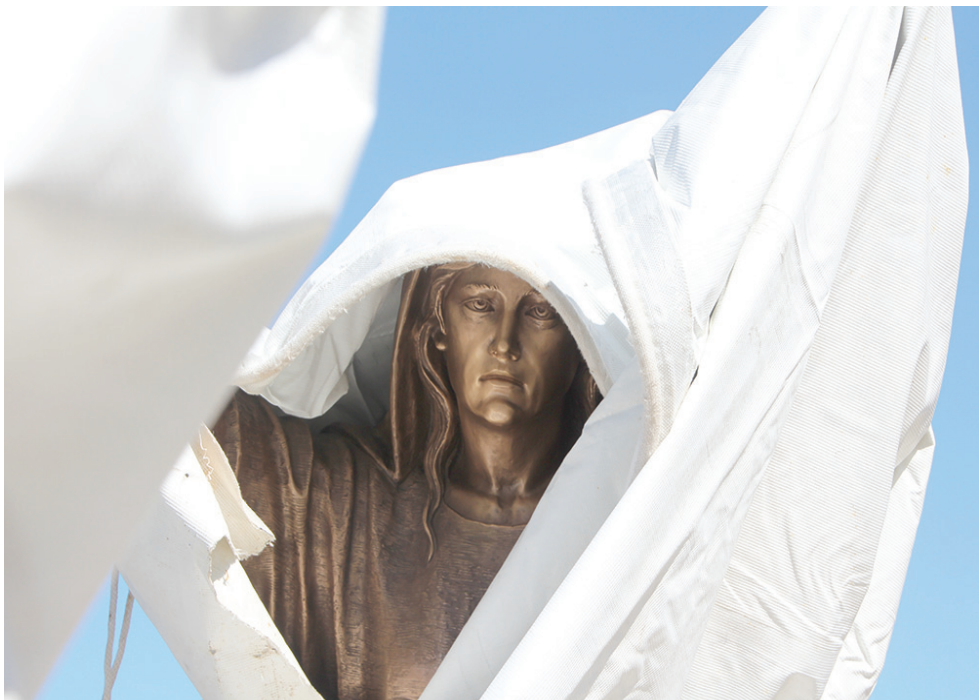
(above) This station is the eighth station, where Jesus meets with the women of Jerusalem. Peeking out from under the protective tarp covering, this statue betrays a look of sorrow.