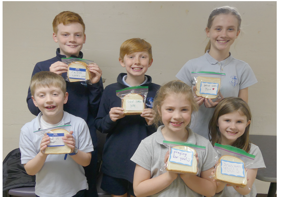
Sixth grade students at St. Joseph, Cold Spring, partnered with the first grade students to help make two hundred peanut butter and jelly sandwiches for The Rose Garden Mission in Newport. Students wrote simple messages reminding the recipients that they are a child of God and that they are loved.