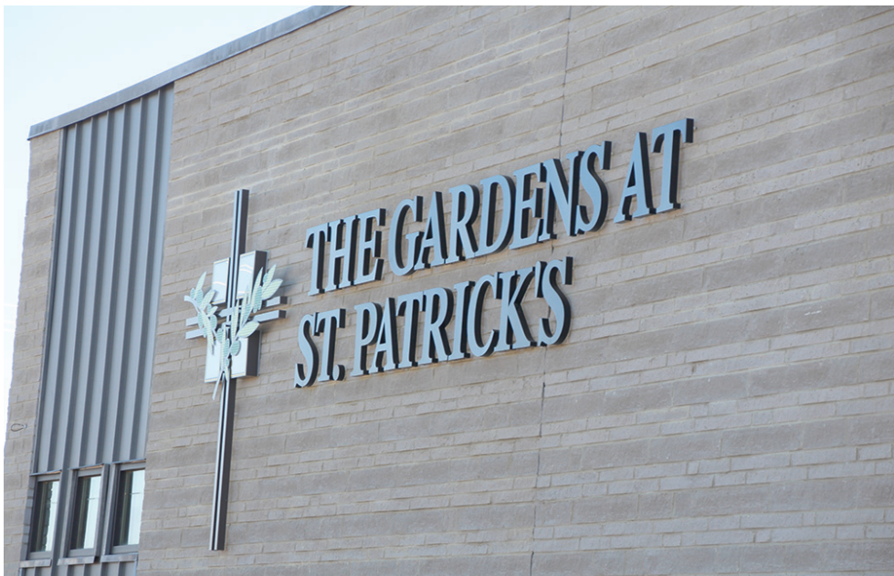
(above) The signage on the front of the welcome center reads "The Gardens at St. Patrick's."