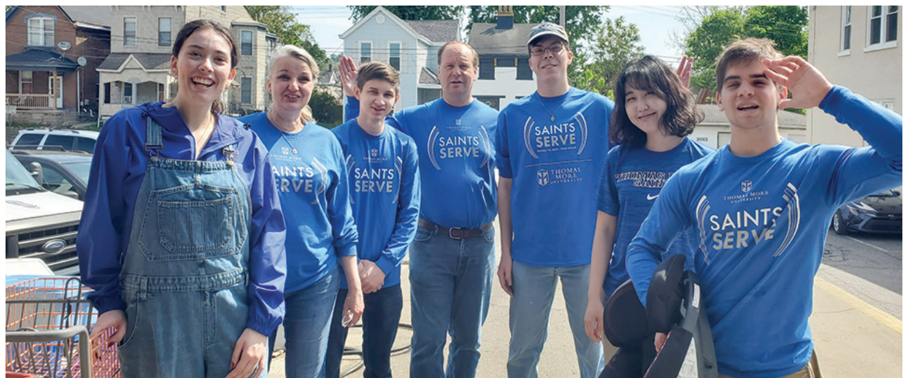
Saints Serve — take two